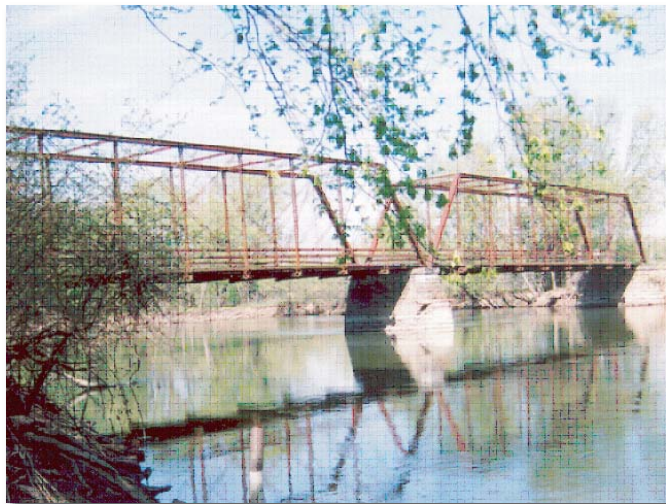
Jackson Co. Bridge